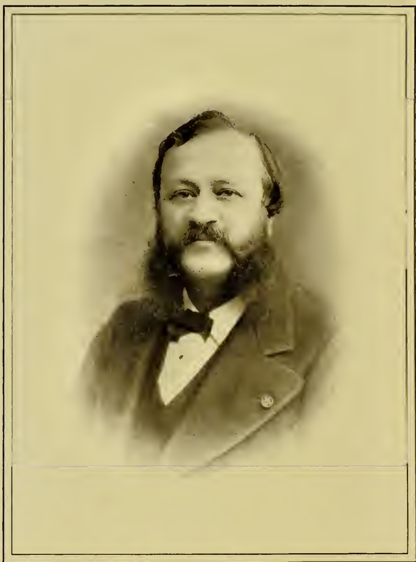
DR. THOMAS W. EVANS.